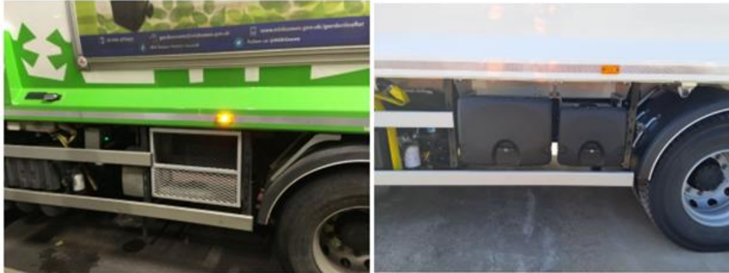
Figure 2: Examples of kerbside collection compartments on RCVs 205

It is acknowledged that there might be limitations in the practicalities of installing SMW cages to RCV vehicles since RCVs do not have uniform proportions, as shown below in figure 2. This practicality issue may be exacerbated further as there is a movement towards electric RCVs. However, these practicality issues should not significantly impact the cost of retrofitting vehicles, and this impact could be analysed in the final impact assessment, collecting further views from waste management companies such as Biffa.