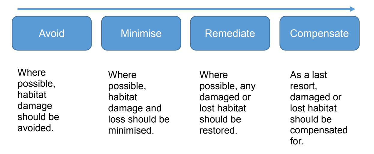
Figure 3: The mitigation hierarchy

Net gain for biodiversity could be delivered by: